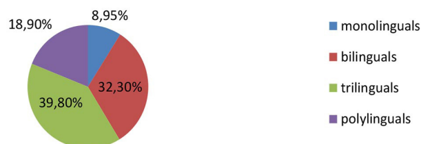
Fig. 2. Language proficiency (%)

According to the chart (Fig. 2), there is a big majority of students as the respondents who know three languages. First of all, three target languages' proficiency that is Kazakh, Russian and English implies the working trilingual policy. There are good reasons to include the share of respondents who know four and more languages in the same group since there are target languages practically in any combination of languages specified above. The share